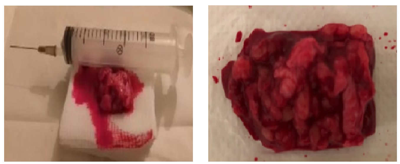
Figure 2. Ultrasound-guided vacuum-assisted excision of gynecomastia: surgical specimen.