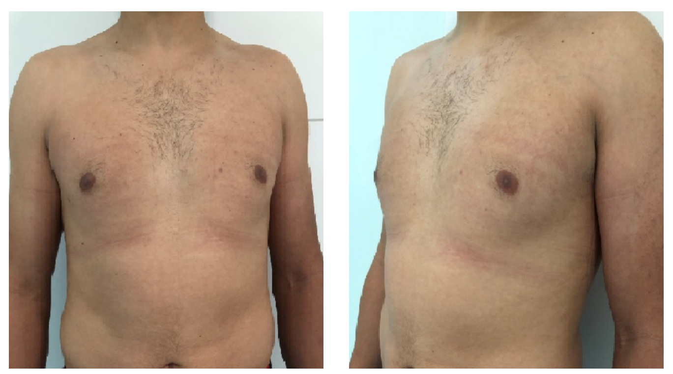
Figure 4. 34-year-old man with Simon grade 2 gynecomastia.

In 2010, the Royal College of Surgeons of England published the first article about a vacuum-assisted biopsy device associated with liposuction to provide a minimally invasive approach for GM, with excellent results<sup>8</sup>. The group suggested that ultrasound guidance could be positive in those cases. One year later, the Chinese experience with a vacuum-assisted biopsy device was also published<sup>9</sup>. Recently, the indications