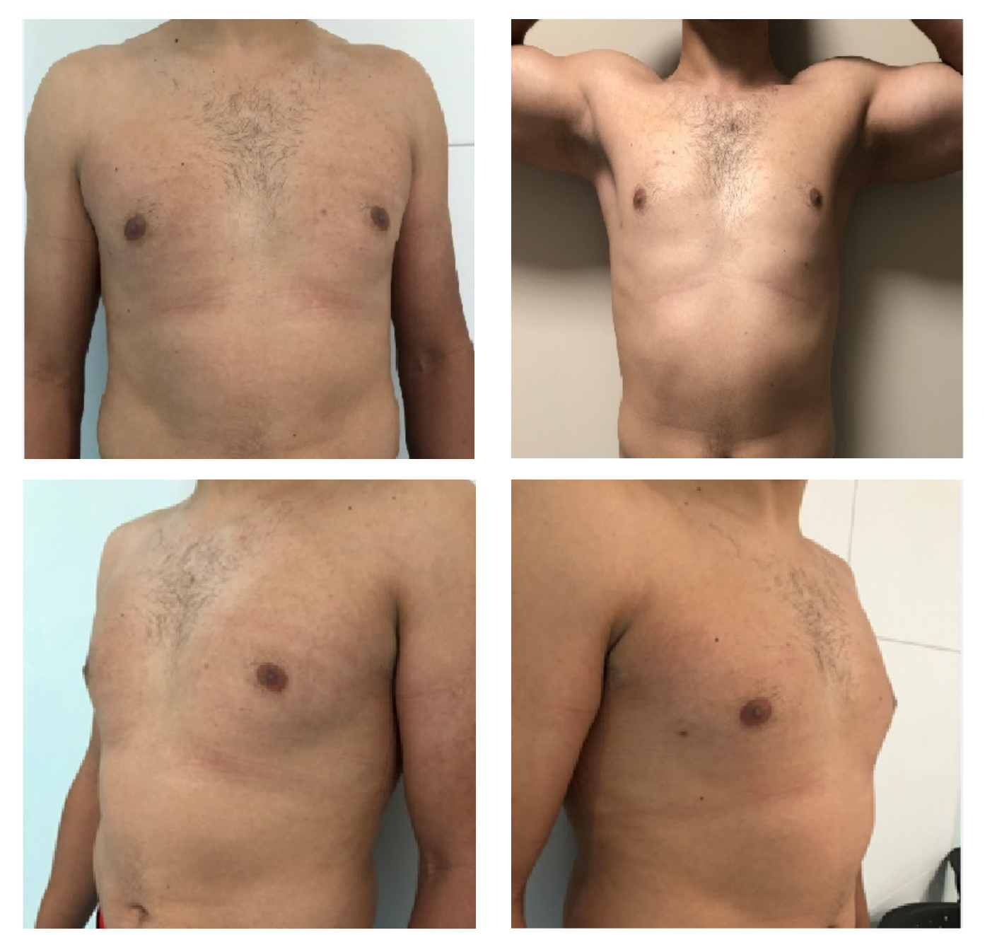
Figure 5. Same patient six months after ultrasound-guided vacuum-assisted excision of gynecomastia.

The benefits of VAE are similar to those of minimally invasive procedures in general — reduced morbidity, better esthetic results, fewer recovery days, and no hospitalization time or cost<sup>8</sup>. The results from this series corroborate the findings of other series and studies. Depending on the GM grade, the VAE can be performed with local anesthesia, with or without sedation. With the evolution of vacuum-assisted devices, better vacuum aspiration, and multiple fragments collected in an automated circular approach with one-step needle insertion, it is possible to remove a considerable amount of breast tissue in a few minutes, reducing the odds of infection or complication. A study reported a median time of 50