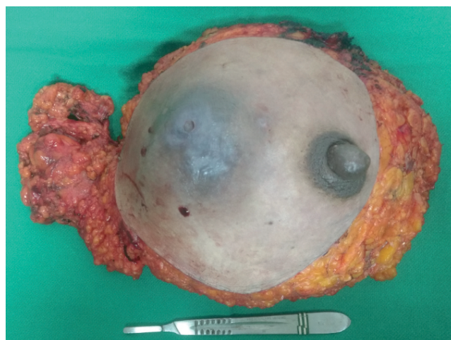
Figure 2. Surgical specimen (right breast).