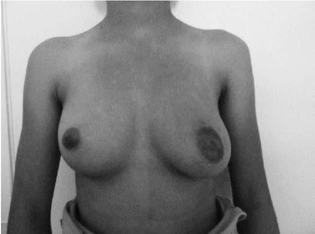
Figure 3. Postoperative photograph of the patient, showing breast preservation with a good cosmetic outcome.