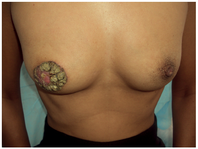
Figure 1. Patient with Paget's disease in the right breast.

Of the 301 cases of breast cancer seen in the period, six patients were identified with PDB (Figure 1), determining a prevalence